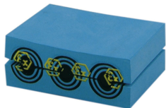
Multidiameter™ 多径 CM 防爆模块